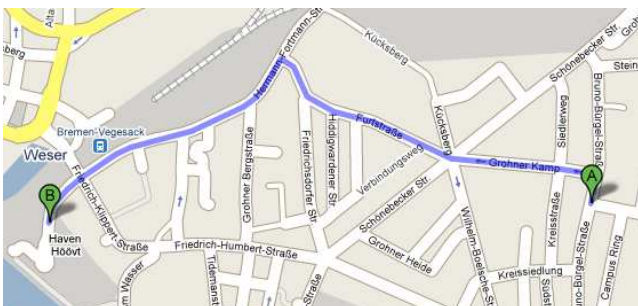
From the main gate to the Haven Höövt shopping mall